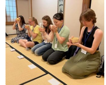
Tea ceremony after the presentations