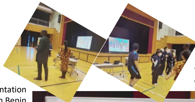
Presentation on Benin