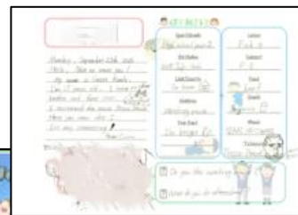
Cards created by Josui High students