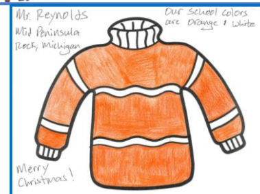
Cards created by Mid Peninsula School students