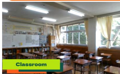
Video message from Tanashi No. 3 Junior High