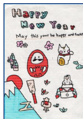
Cards created by Tanashi No. 3 Junior High students