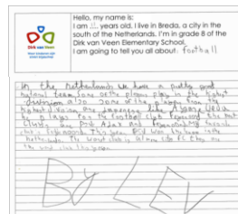
Card about a Japanese soccer player written by a Dutch student