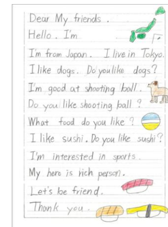
Kamishakujii students made two types of cards: one with a self-introduction, and another about Japanese culture