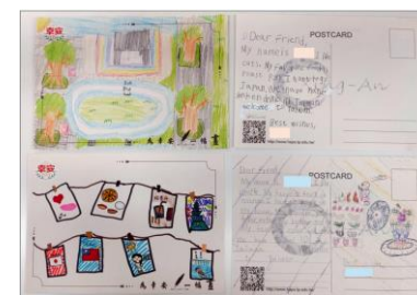
Cards made by Xing-An students