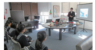
Embassy international education program