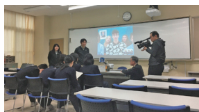
Online cultural exchange

※For details and more examples of exchange events, please visit our website.